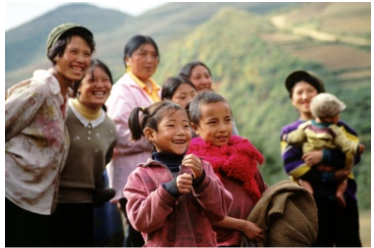
Yi people in Liangshan

Yi people and the China Development Brief are available on our website at http://www.anian.net/fhs/liangshanpeoples.html