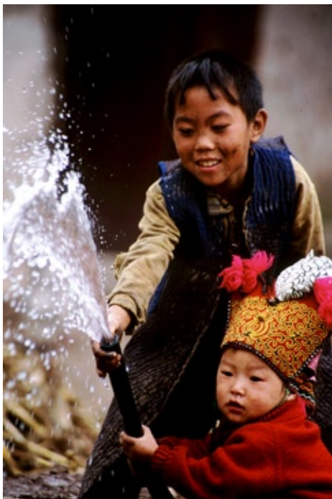
Children of Liangshan Yi farmers

After 1949, in line with the new nationalities policy, the central government established Yi autonomous Prefectures in Liangshan, Sichuan, and Chuxiong and Honghe (Hani and Yi) in Yunnan. Nine autonomous counties, either exclusively Yi or combined with other ethnic groups, were established in Yunnan, one in Guizhou and one in Guangxi.