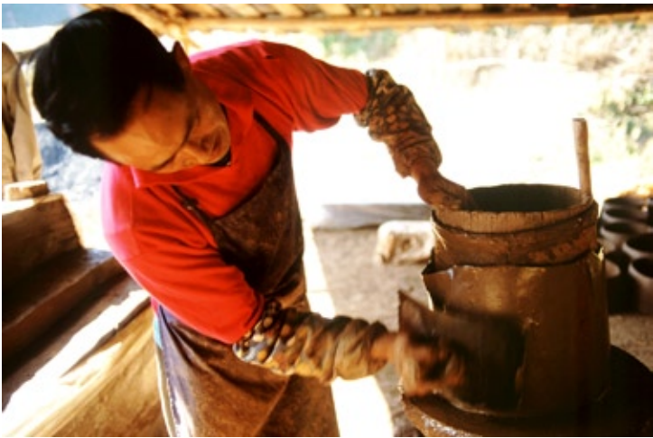
Yi man making roof tiles

Getting children into school is of course only the very beginning of the educational process, [&] the barriers to significant learning achievement are daunting. Perhaps pre-eminent among them is the extremely difficult issue of language. [Education] authorities say the early grades of primary school are taught in Yi language, with Mandarin being introduced as the main language of instruction at a later stage. Children who drop out of school before completing basic education may therefore have only a smattering of Mandarin, which will constrain their potential in later life for engaging with the wider world; and even those who stay through junior high school will be disadvantaged in progressing to higher educational levels within the Mandarin