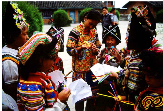
FH&S Yi Orphans Receiving New Gifts

Amazon.com has agreed to donate to us 5% of the cost of orders that originate from Friendship Homes and Schools. If you shop at Amazon.com, please use one of the following methods to visit the Amazon.com web site: 1) Go to the "Sponsorship" section of the Friendship Homes and Schools web site and click on the link to Amazon.com, or 2) bookmark the following link in your web browser and use it as your usual link to Amazon.com: http://www.amazon.com/exec/obidos/redirect-home/friendshihome-20 There is no difference in your purchase costs.